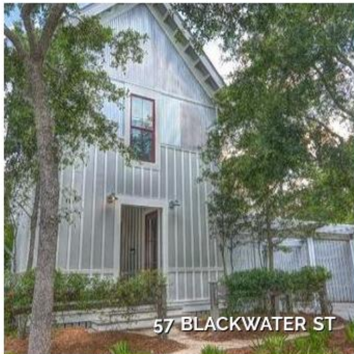
57 BLACKWATER ST