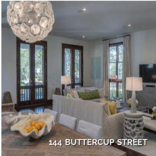
144 BUTTERCUP STREET