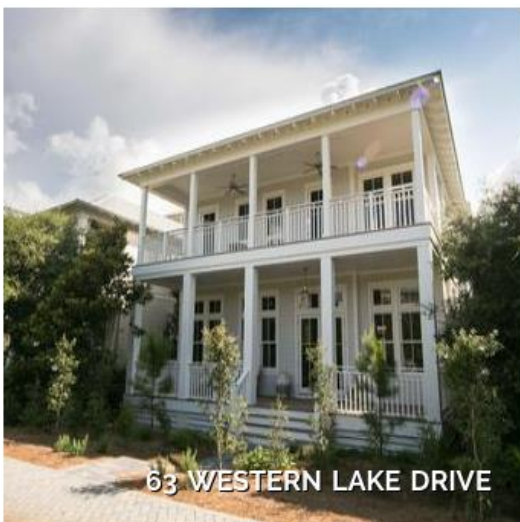
63 WESTERN LAKE DRIVE