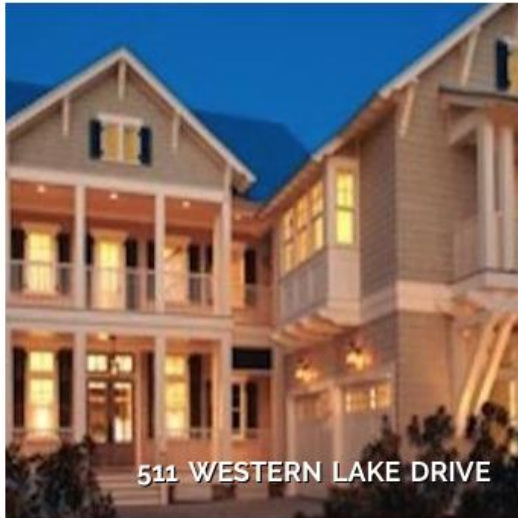
511 WESTERN LAKE DRIVE