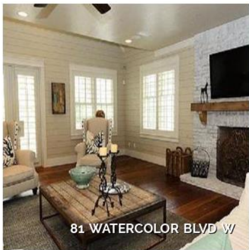
81 WATERCOLOR BLVD W