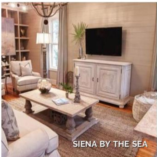
SIENA BY THE SEA