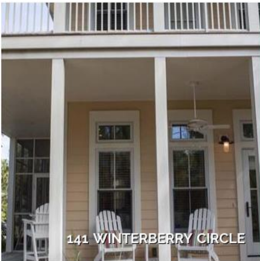
141 WINTERBERRY CIRCLE