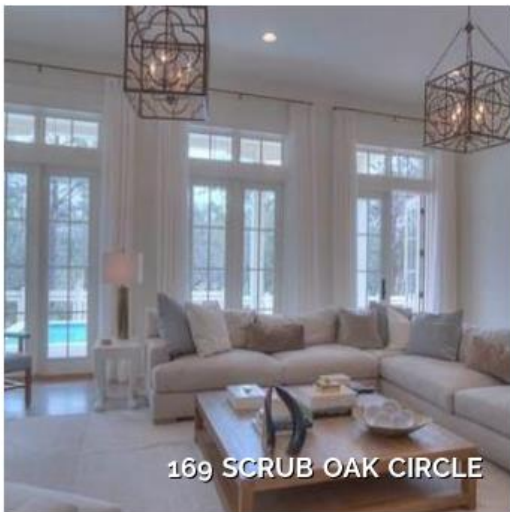
169 SCRUB OAK CIRCLE