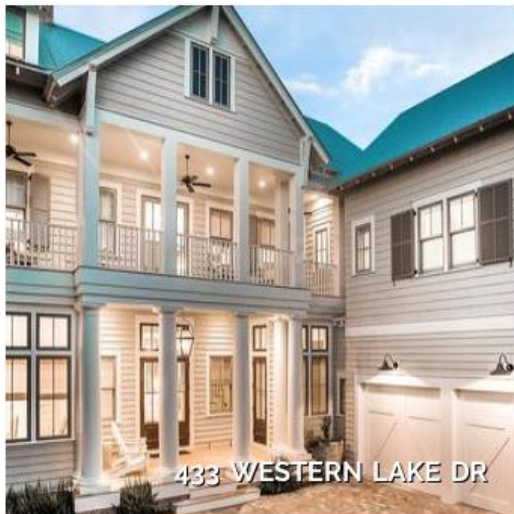
433 WESTERN LAKE DR